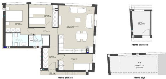
General property plan (3 bedroom option)