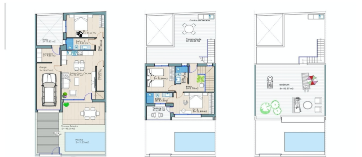
Example of a 3 Bedroom and 3 Bathroom Property Plan