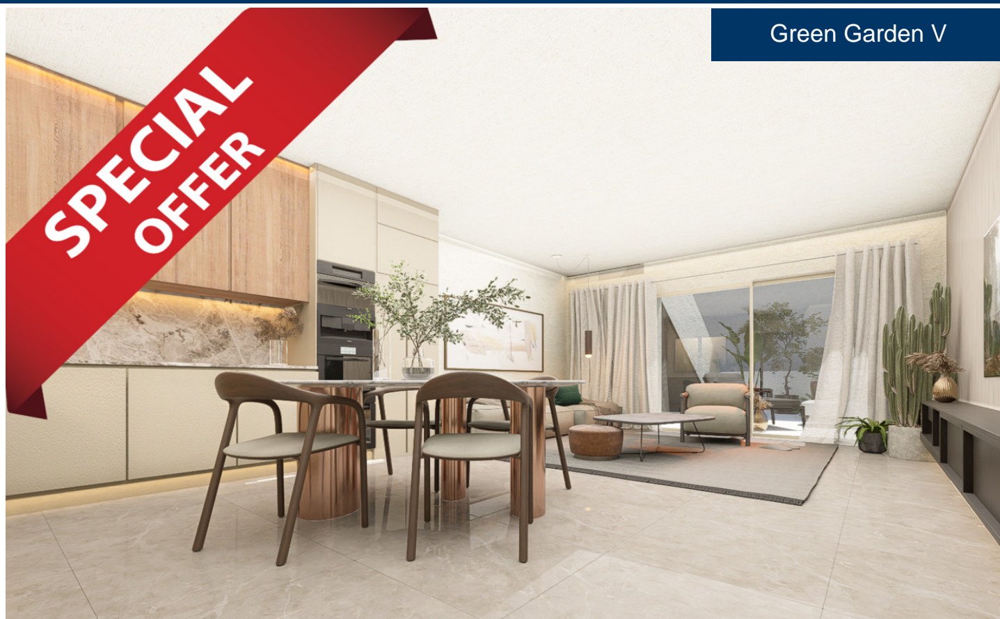
Green Garden V